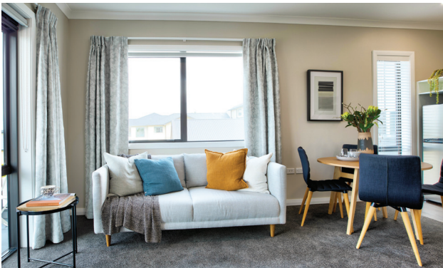
Above | Open plan living with room for family and friends