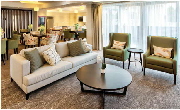
Above | Enjoy living in a welcoming and vibrant community