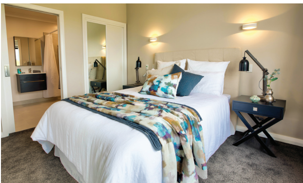
Above | Separate double bedroom with a large ensuite