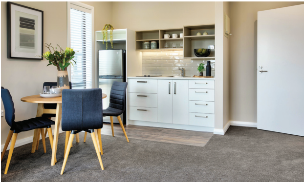
Above | Cook in your kitchenette or have meals delivered