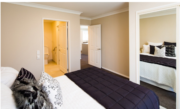
Above | Relish in your spacious master bedroom