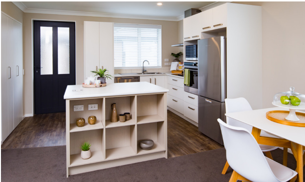
Above | Entertain guests in your full-sized kitchen