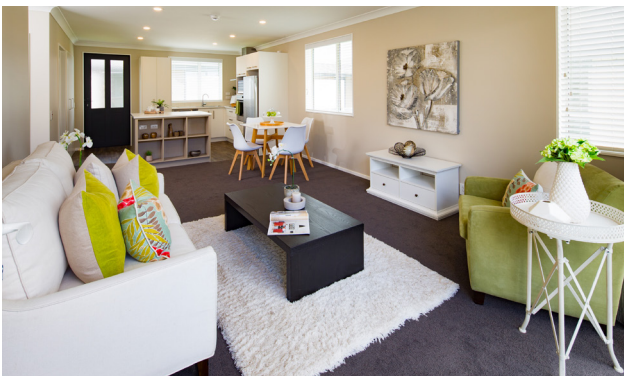
Above | Love open plan living. Perfect for entertaining