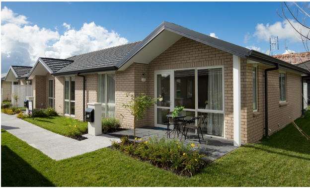
Above | Enjoy living in a welcoming and vibrant community