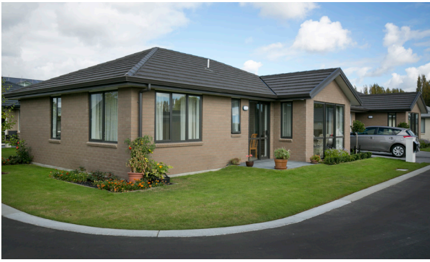
Above | Enjoy living in a welcoming and vibrant community