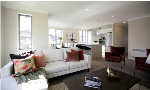
Above | Love open plan living. Perfect for entertaining