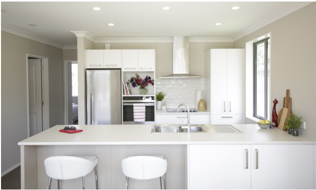
Above | Entertain guests in your full sized kitchen